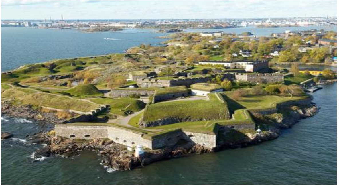
GRAPH 6. Fortress of Suomenlinna (adapted from World Heritage Site2012).