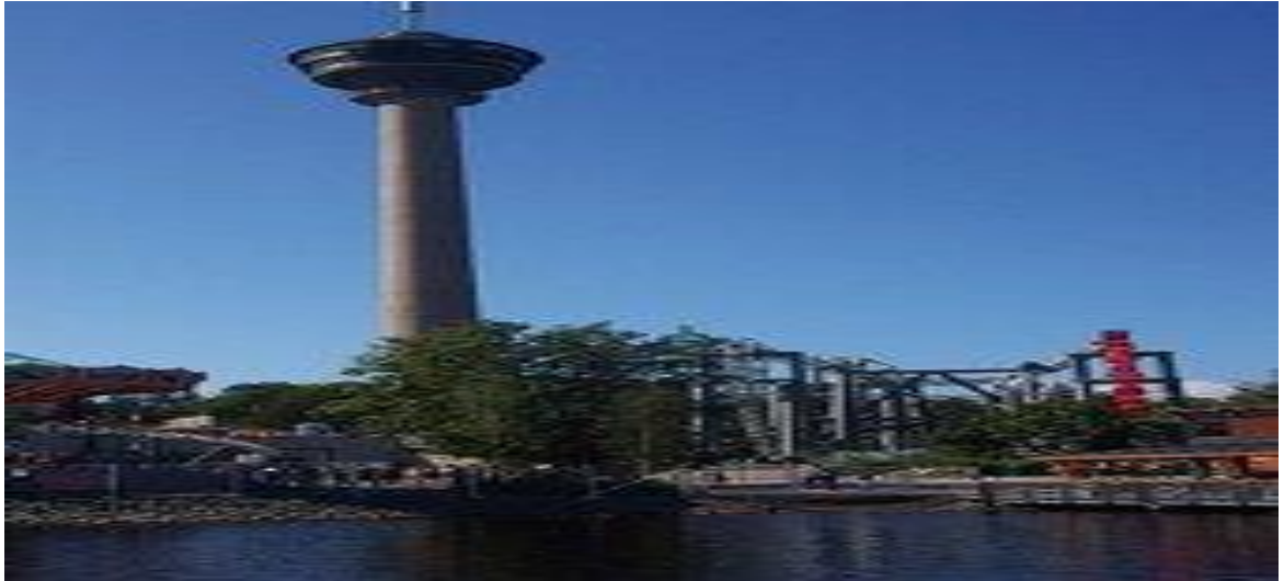
GRAPH 1.Näsinneula Tower (adapted from visittampere2013)