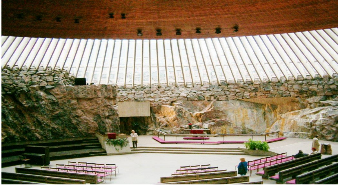
GRAPH 5. Temppeliaukio Church in Helsinki (adapted from Sacred-destinations2012).