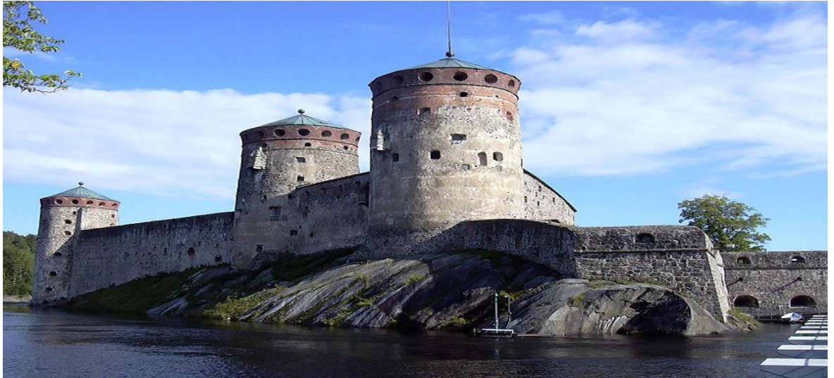
GRAPH 2.Olavinlinna Castle (adapted from Olavinlinna Castle2012)