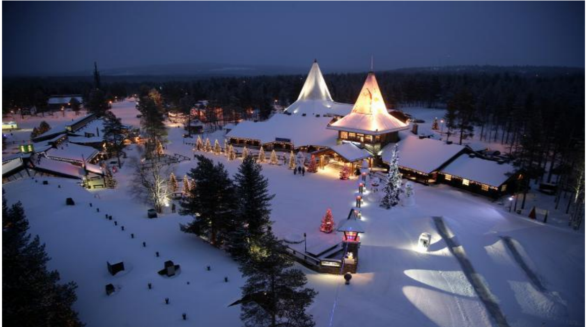
GRAPH 9. Santa Claus Hometown (Adapted from Visitrovaniemi2012)

As Rovaniemi is located at the northern Arctic Circle, it has become a forward looking town with its own unparalleled features. The Arctic Circle brands the southern appendage of the glacial day, it has 24 hours of sunlit days which are often called the midnight sun and glacial nights, 24 hours of sunless nights. Once a year in between June and December the sun is above the horizon for 24 hours in the north of the Arctic Circle which makes Rovaniemi an attractive tourist destination in Finland. Many tourists come to enjoy the midnight sun and its own features. (Rovaniemi-The official hometown of Santa Clause2012.)