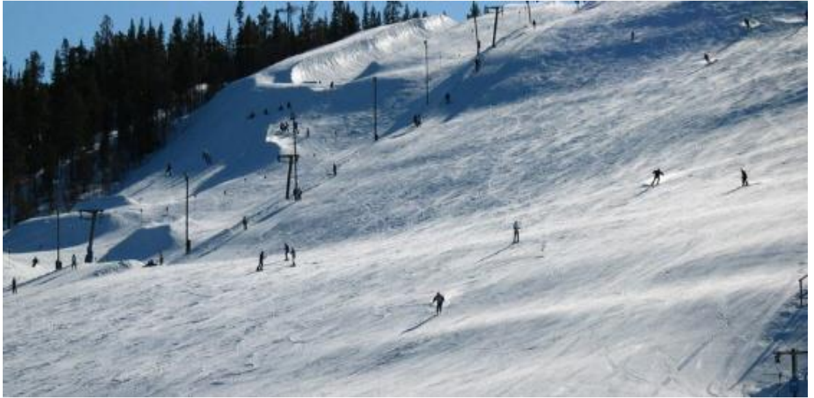
GRAPH 10. Levi Ski Resort (adapted from Levi Ski Resort2012).

The summer season is also attractive to tourists visiting Levi and the summer season is started from mid June until mid August. As Levi is situated within the Arctic Circle, it has short warm summers and long cold winters which require taking care of visitor's dress and different needs concerning the winter cold. Levi is comparatively warm in the summer time and usually has a temperature of 10°C to 25°C in the summer months which is perfect for downhill mountain biking, roller blading, hiking, Nordic walking, motor biking, horse riding, canoeing and rafting and the 20 th July is normally the warmest day in the summer. Tourists can enjoy summer holidays with their families in Levi. (Lapland2012). During the winter without skiing, Northern Lights can also be enjoyed by the tourists and its scientific name is Aurora Borealis and the specialty of this is changes of color which mostly is bright green and besides the bright greens, blues oranges and pinks can also be seen in the Northern Lights in Levi. (Lapland Holidays-Levi2012). The next graph shows a picture of Aurora Borealis in Levi (GRAPH 11).