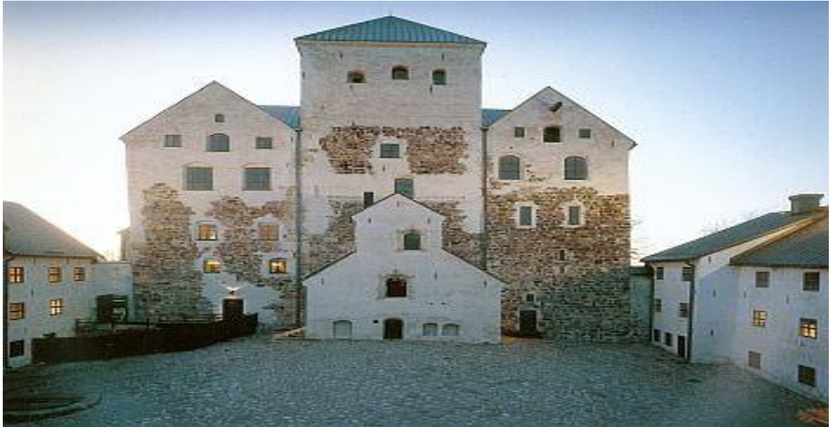
GRAPH 4. Turku Castle in Turku (adapted from NBA2012)