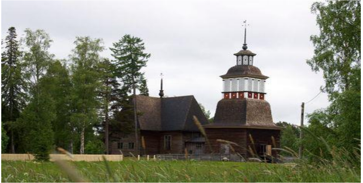
GRAPH 3. Petäjävesi Old Church (adapted from UNESCO2012)