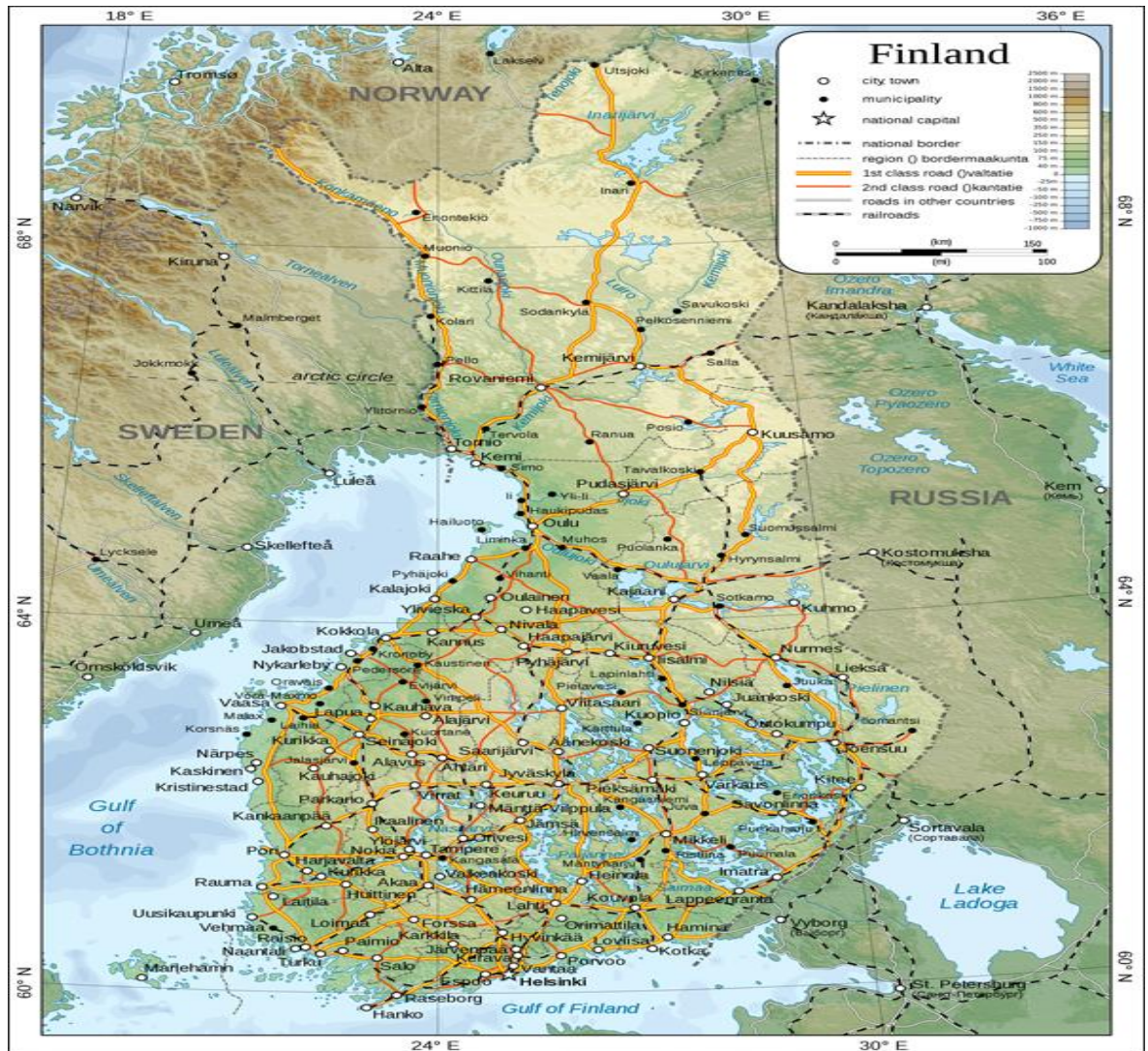
GRAPH 8. Details map of Finland with all cities, roads, railways and airports (adapted from Vidiani maps of the world2013)