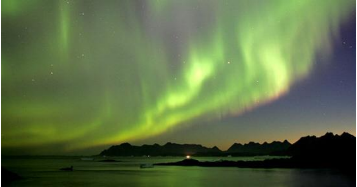
GRAPH 11. A picture of Aurora Borealis in Levi (Adapted from Levi-Lapland2012)